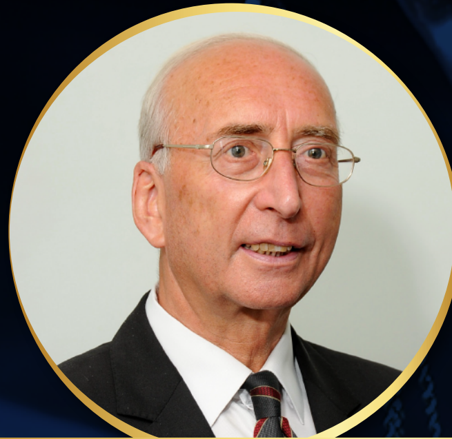
DR. HELMUT TÜRK

Topic - The Development of the Contemporary Law of the Sea and Current Issues